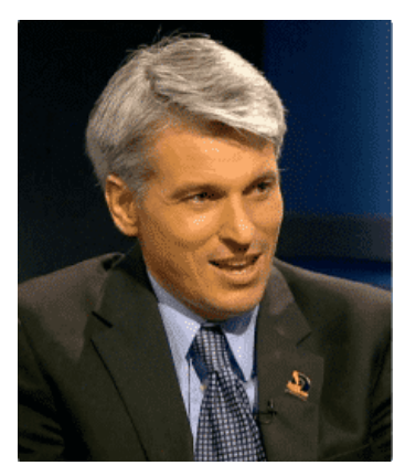
Herbal Remedies Workshops Wed.-Fri. 10:00 AM, Schoolhouse Herbal Remedies Seminar Wed.-Sab. 4:00 PM. Main Tent